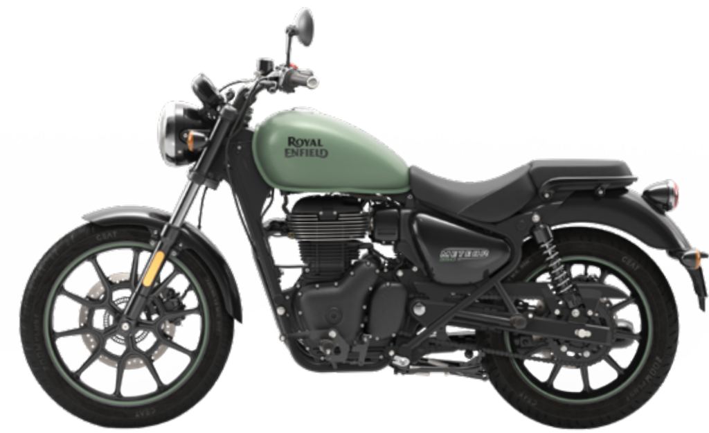
FIREBALL MATT GREEN