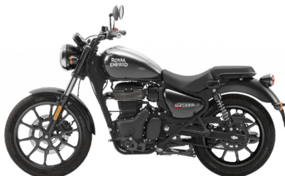
FIREBALL BLACK CUSTOM (MIY)