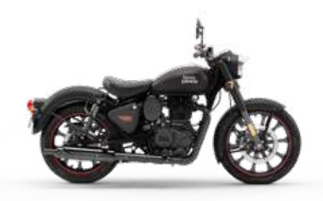
DARK STEALTH BLACK